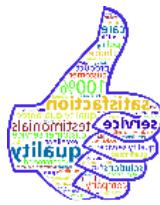
Service Quality Increase